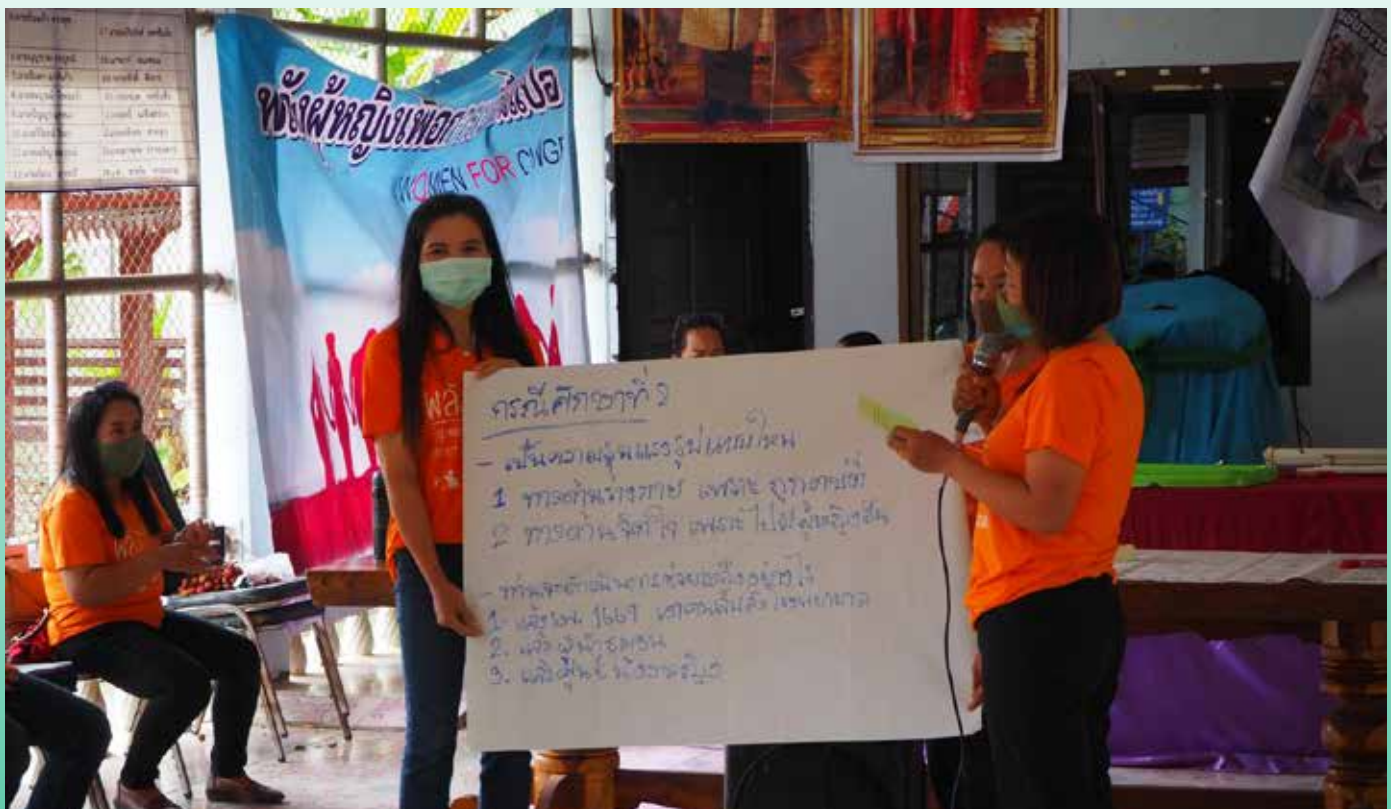
Above: Women present the ideas they discussed in a small group activity during a Women for Change workshop attended by women from villages through Chiang Khong to learn more about their rights, the law, and to gain confidence to speak up for themselves and others against injustices and gender-based violence that occurs in their communities.