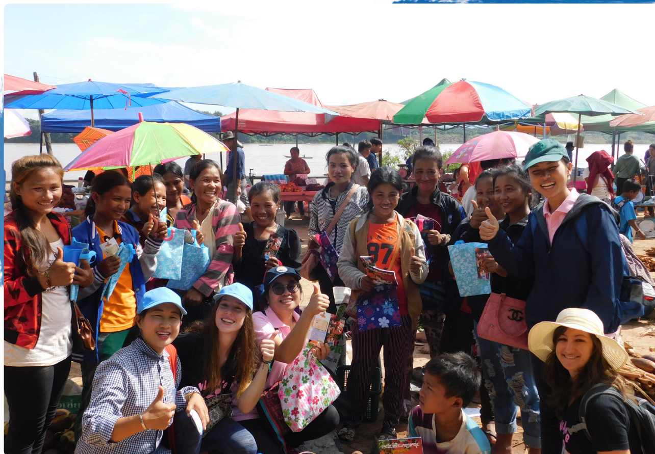
CFG campaigning to prevent human trafficking and CSEC at key border crossing points in Chiang Khong