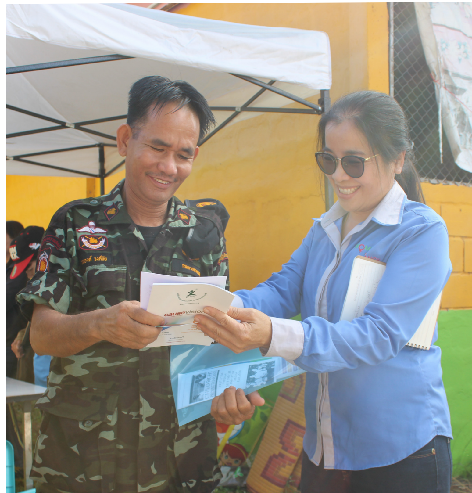
Nunnaree handing out information on child rights and protection at a local market