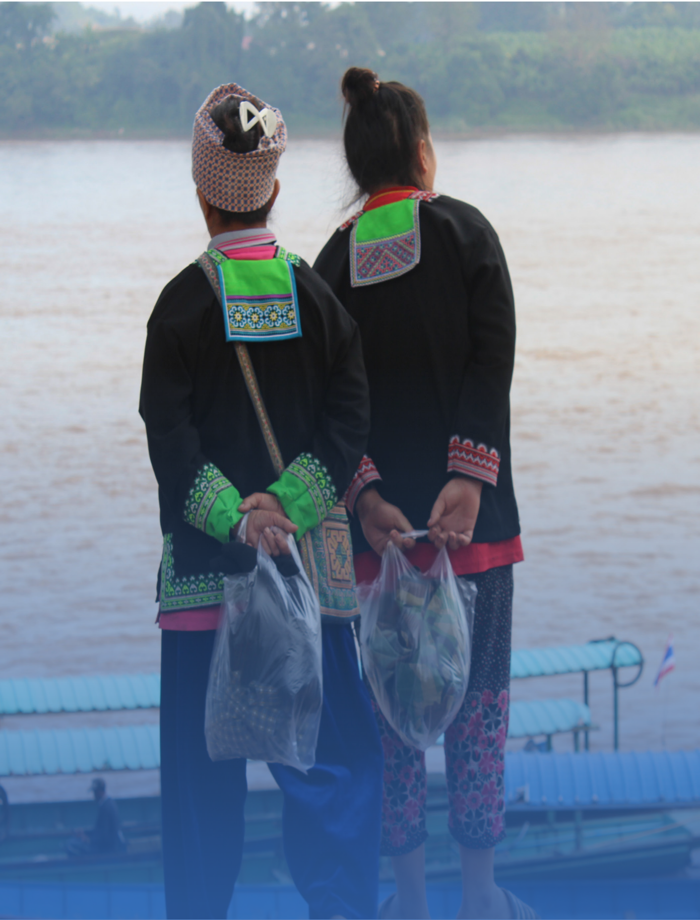
Two Hmong women look across the Mekong River from Thailand to Laos