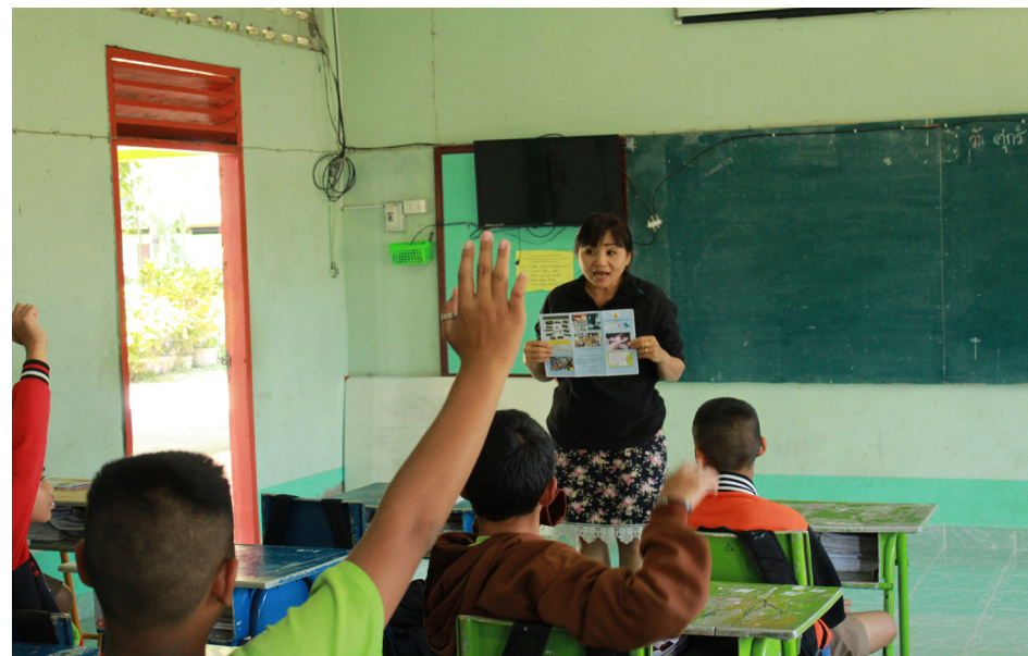
Top left: Women For Change Project Team meeting, Top right: International Day For the Elimination of Violence Against Women campaign (WFC) Middle left: A police officer supports the campaign message "The new generation of men does not use violence", Bottom: A teacher in Phan educates students on child rights and protection