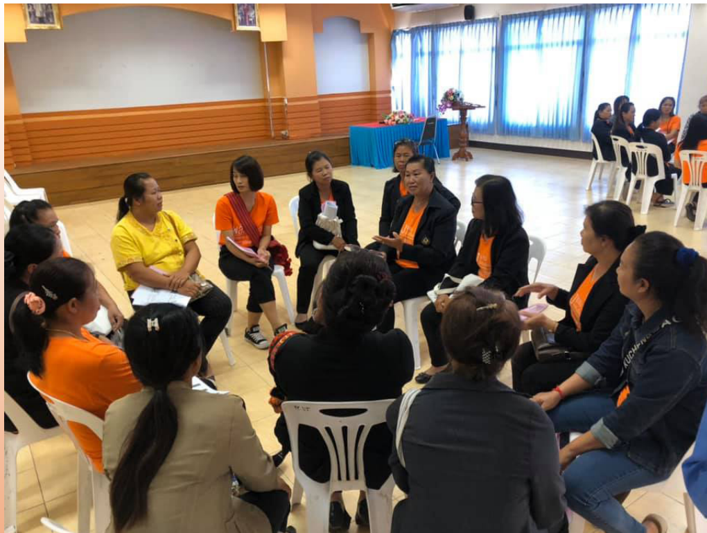
Above: Women participate in a small group activity during a workshop attended by women from villages through Chiang Khong to learn more about their rights, the law, and to gain confidence to speak up for themselves and others against injustices and gender-based violence that occurs in their communities.